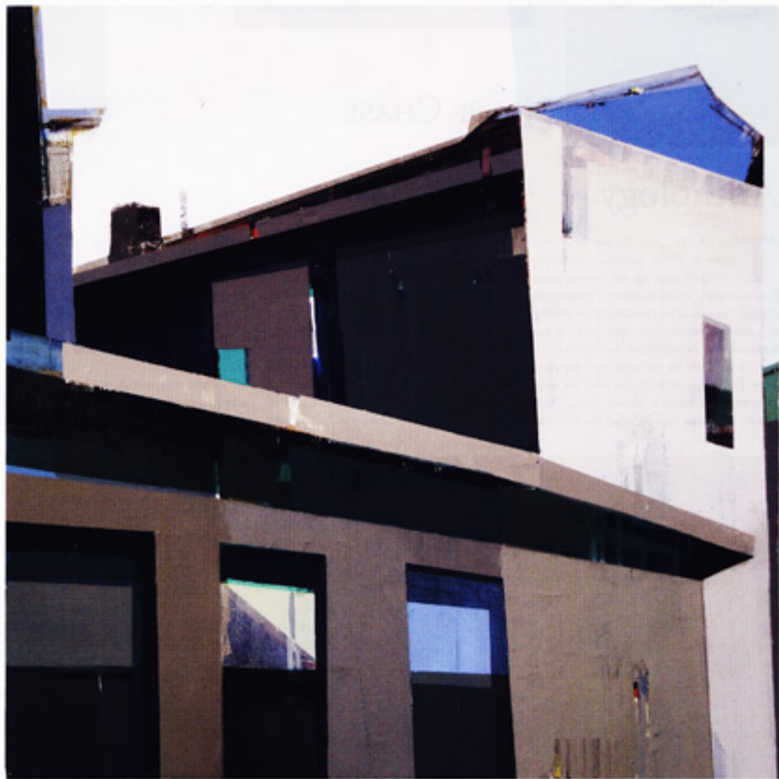
EAST COAST, OIL ON CANVAS, 30 X 30"