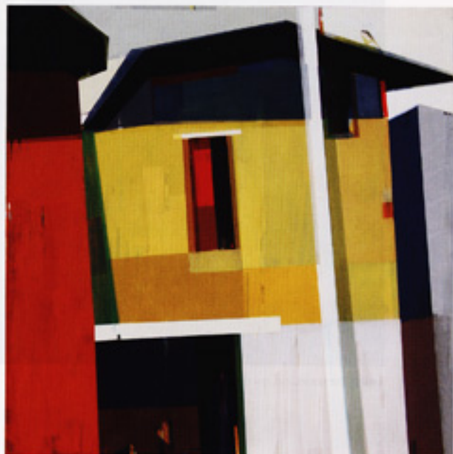
HOMETOWN, OIL ON CANVAS, 48 X 48"